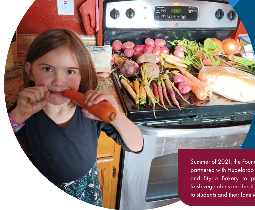
Summer of 2021, the Foundation partnered with Hugelardo Farms and Styria Bakery to provide fresh vegetables and fresh bread to students and their families.